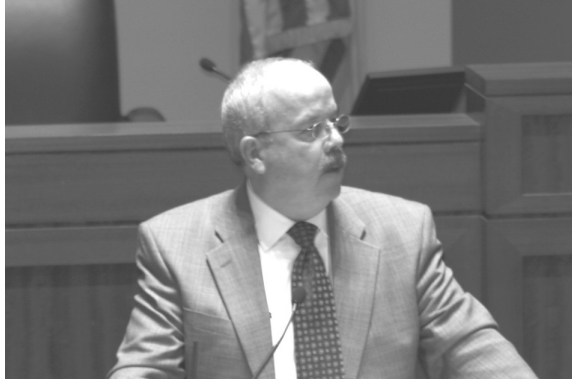
The Honorable Terrance W. Gainer, Sergeant at Arms, United States Senate, giving the keynote address at the Contemporary Issues and Ethics Conference.