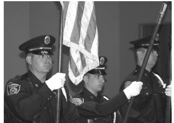
The Dallas County Sheriff’s Department Honor Guard at opening ceremonies of the Contemporary Issues and Ethics Conference.