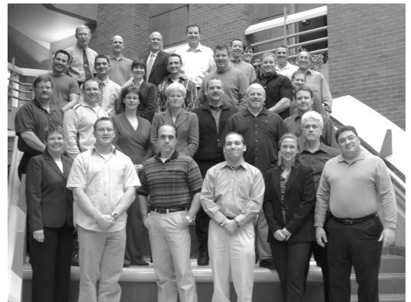
Group photograph of the Ethics Train-the-Trainer class conducted February 11-15, 2008, at the Justice Institute of British Columbia in Canada.