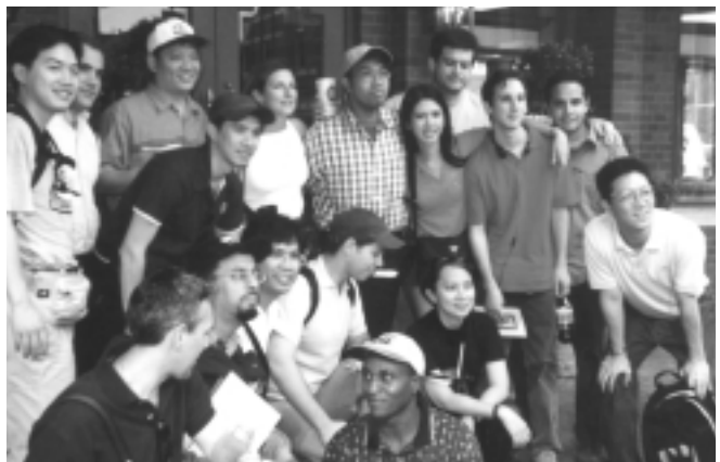
An international family. Participants in the 2001 Academy came from 41 nations. A large group is shown here during a trip to Fort Worth.